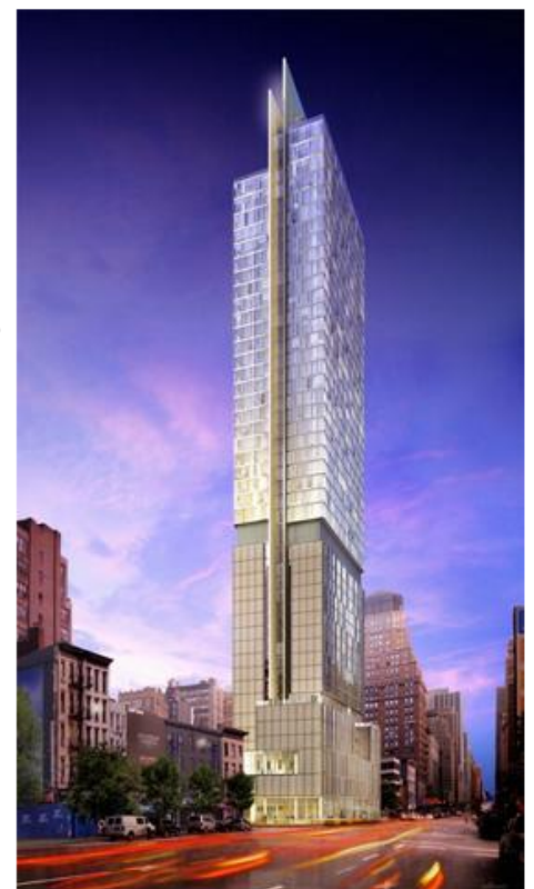
Eventi New York

Adjacent to the hotel's outdoor public plaza is an impressive 20-foot-wide multi-media art screen to be used for public and private events, a feature that celebrates North Chelsea's vibrancy and urban rhythm. Due to open in Autumn 2010, dining at Eventi will offer New York's first contemporary Basque cuisine in a futuristic setting, with indoor and outdoor dining and a specialty bar serving a unique collection of whiskies and spirits, overseen by China Grill Management – operators of restaurants including Asia de Cuba and Suka at London's Morgan Hotels.